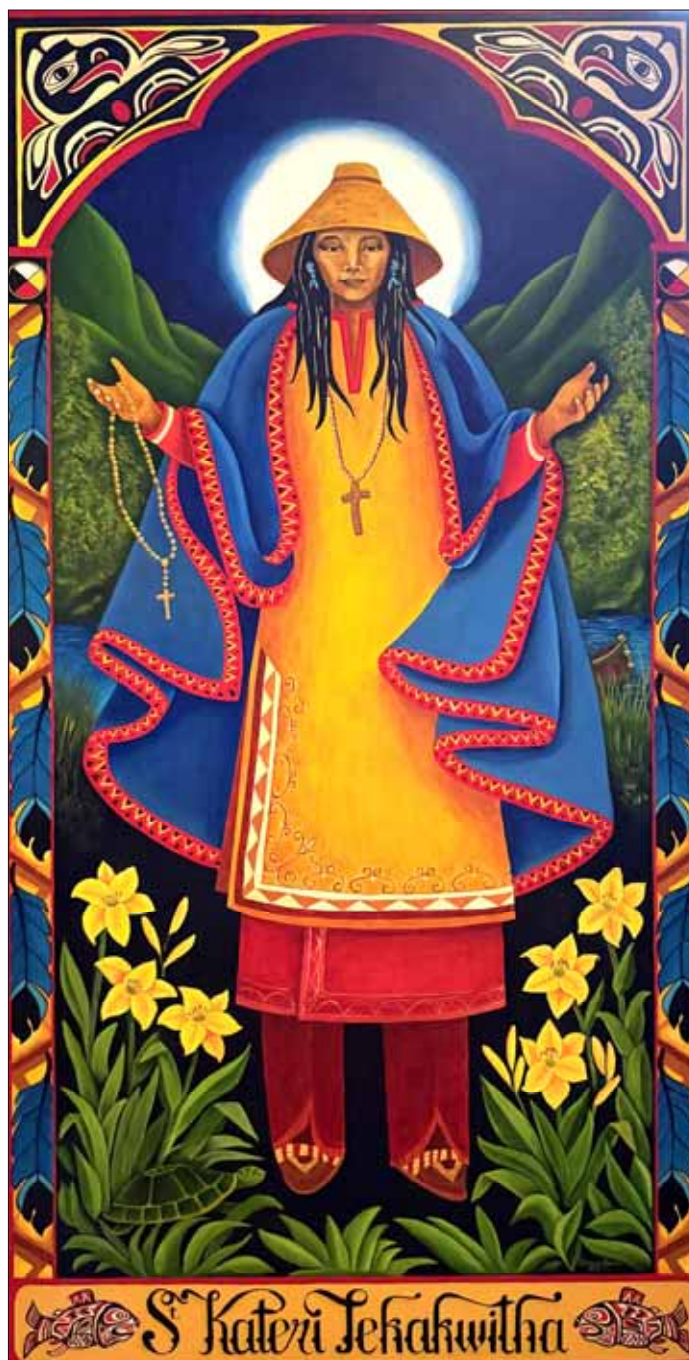
O Saint Kateri, Lily of the Mohawks, Your love for Jesus, so strong, so steadfast, pray that we may become like you. St. Kateri, pray for us. St. Kateri, walk with us.

St. Kateri is called the Lily of the Mohawks because of her purity, and she stands amid a garden of lilies. At her foot, a turtle reminds us that she belongs to the “Turtle Clan” of the Mohawk people. St. Kateri is also the patron saint of nature, ecology, and the environment, and nature is alive all around her. A river flows with a canoe peeking behind her. The pine trees in the distance are native to the Coast Salish area, and