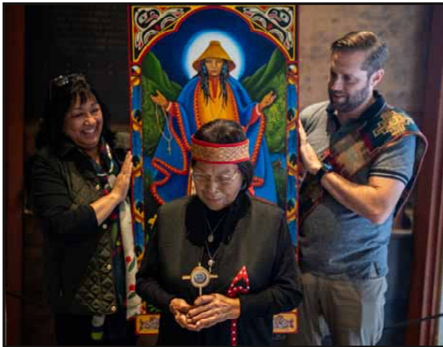
Swinomish elders participated in the Mass, along with the Cathedral's Racial Solidarity Team. A relic of St. Kateri was carried in procession with the new icon.