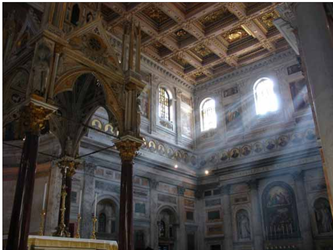
Interior of the Basilica of St. Paul Outside the Walls, Rome. It was here, on January 25, 1959, that Pope John XXIII announced his plan for the Second Vatican Council.

T hat first Christmas in the Vatican, Pope John XXIII revived an old custom of Pius IX, and astonished the world, by leaving the confines of Vatican City to visit orphans and prisoners in Rome. The children greeted him warmly, some of them mistaking him for “Babbo Natale,” Father Christmas! The men at Regina Coeli prison knelt outside their cells to receive his blessing. A man convicted of murder wept as he asked the Holy Father