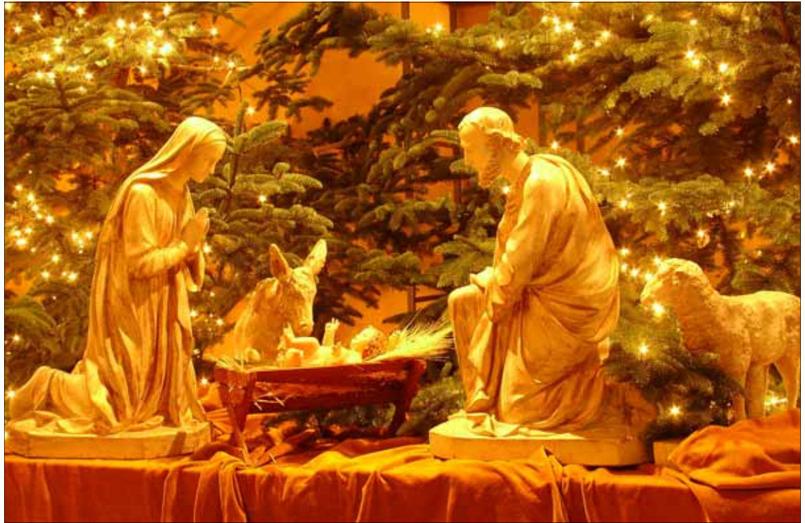
image comes to mind as I remember a time when I attended 5:30pm Mass on Christmas Eve.

C hristmas is my favorite holiday of the year. There is nothing more special to me than being able to celebrate the birth of Jesus Christ here at St. James Cathedral every December. As I write this reflection, one particular