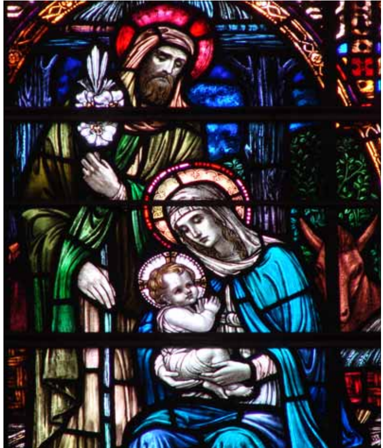
How can we make sure we take time this Christmas to stop and wonder at the God who came among us as a little child, born in a stable and laid in a manger?

CARING FOR OURSELVES COMES FIRST. When we fly on an airplane, we’re told that in the event of an emergency, we have to put on our own oxygen mask before we help someone else with theirs. In other words, we have to give ourselves some space to breathe before we can be effective in caring for others. It is the same when it comes to preparing for the holidays. We have to care for ourselves first. But that can be hard to remember when we’re so busy taking care of everyone we care about! So, during Advent, I try to be more careful to set aside time for prayer, to get enough sleep, to simplify my preparations so as to enjoy them more. Taking time for prayer is especially important in the midst of holiday frenzy, but I try not to turn this increased attention to prayer into another pre-Christmas task, itself another