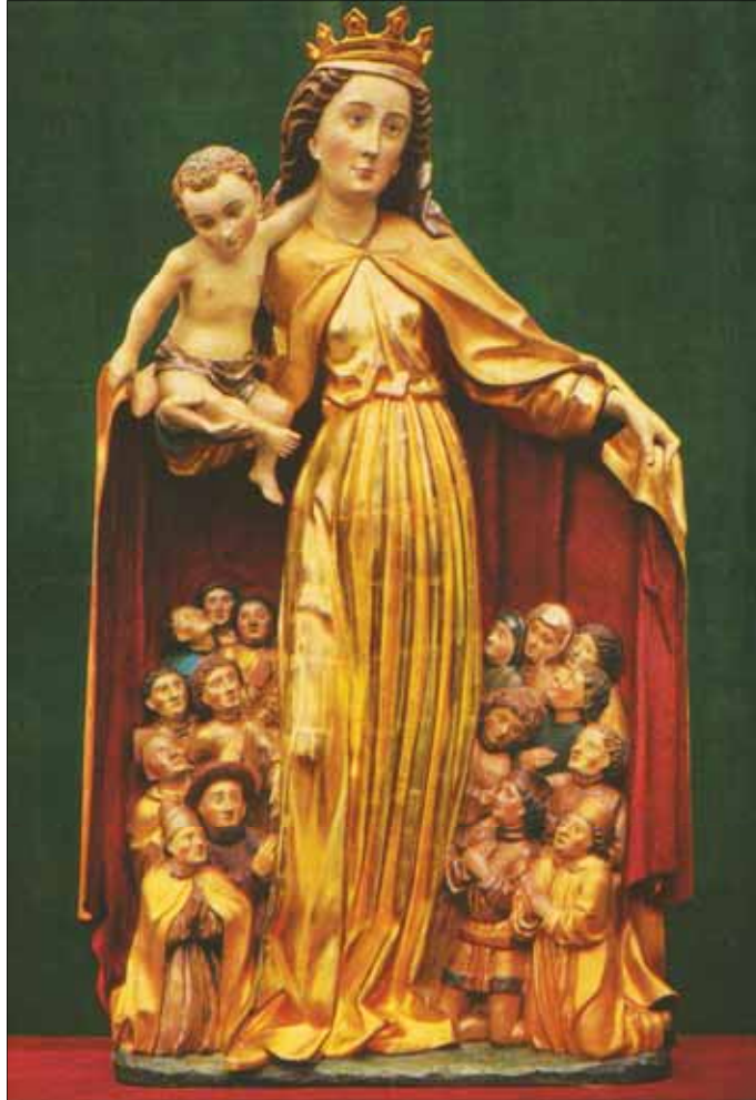
Schutzmantelmadonna, Markdorf, 1470

The great St. Bernard of Clairvaux once wrote, De Maria, numquam satis (One can never say enough about Mary). He was right. Maybe after reading the thoughts of your fellow parishioners you will find yourself thinking your own thoughts about Mary and who she is to you. During these days of Advent and Christmas when Mary is such a central part of the