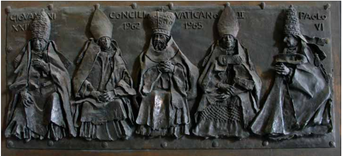
A relief on the doors of St. Peter's Basilica commemorates the Council. John XXIII is depicted at the far left.