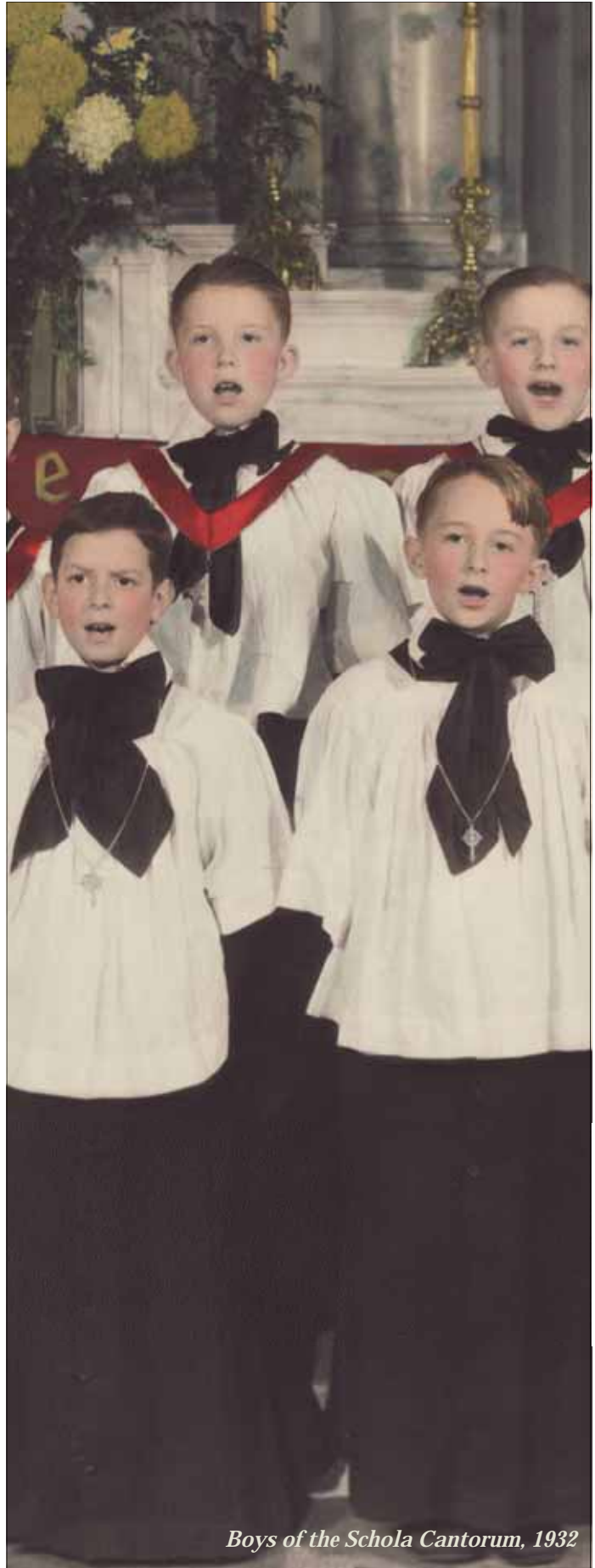
Boys of the Schola Cantorum, 1932

Phone 206.622.3559 Fax 206.622.5303 www.stjames-cathedral.org