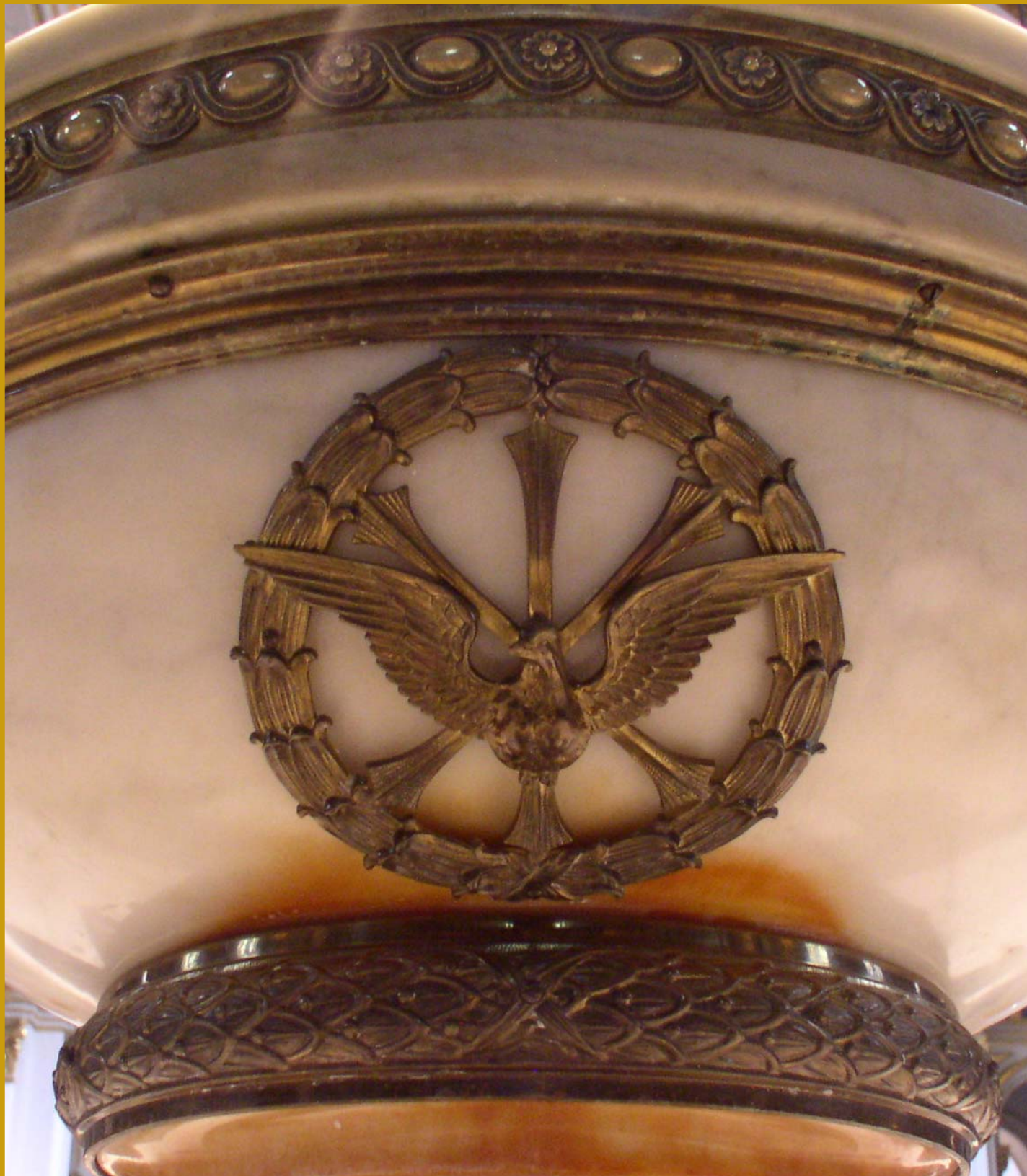
ST. JAMES CATHEDRAL The Sixth Sunday of Easter May 14, 2023