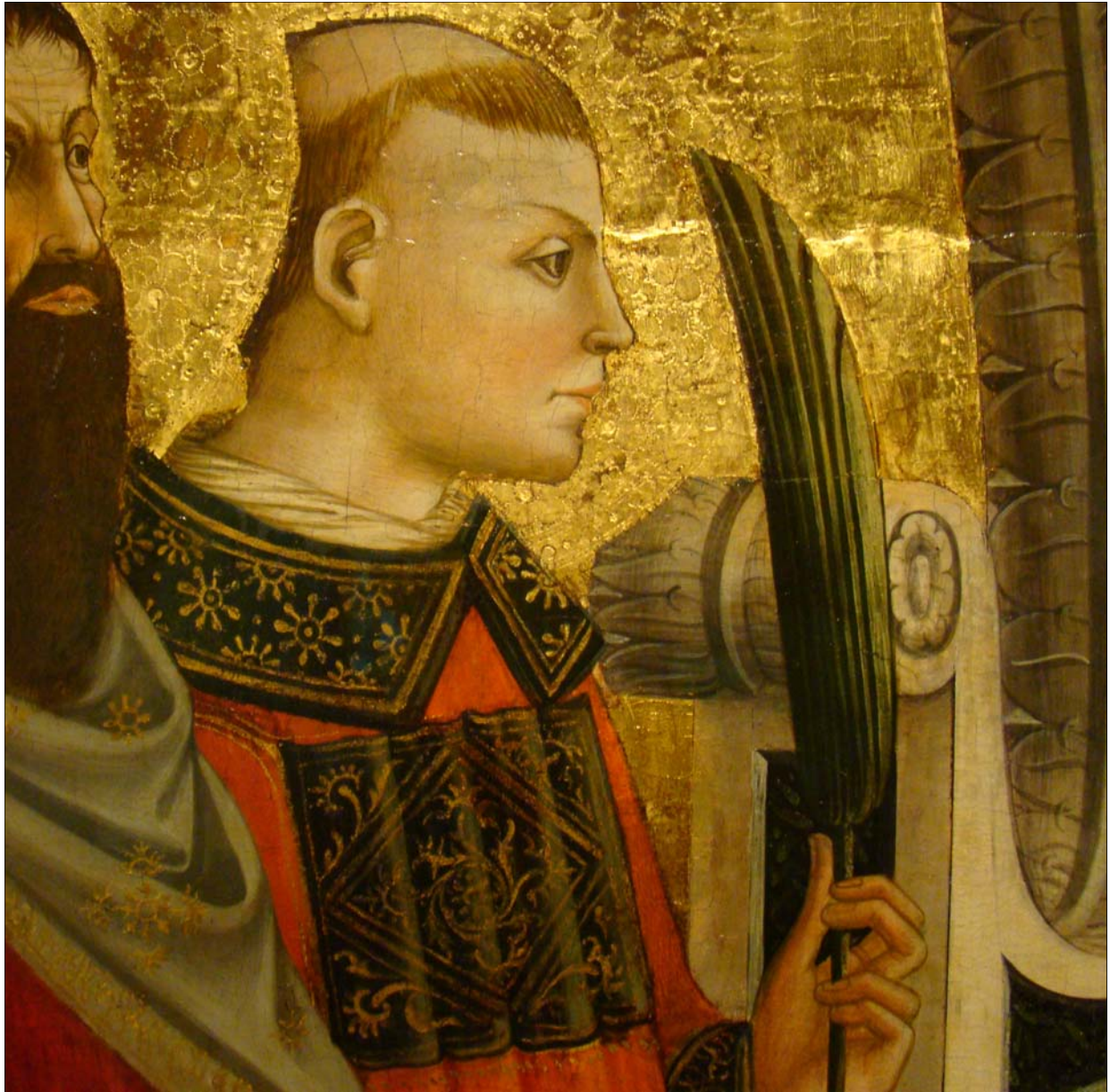
Virgin & Child with Saints (detail of St. Lawrence). Neri Di Bicci, ca. 1456