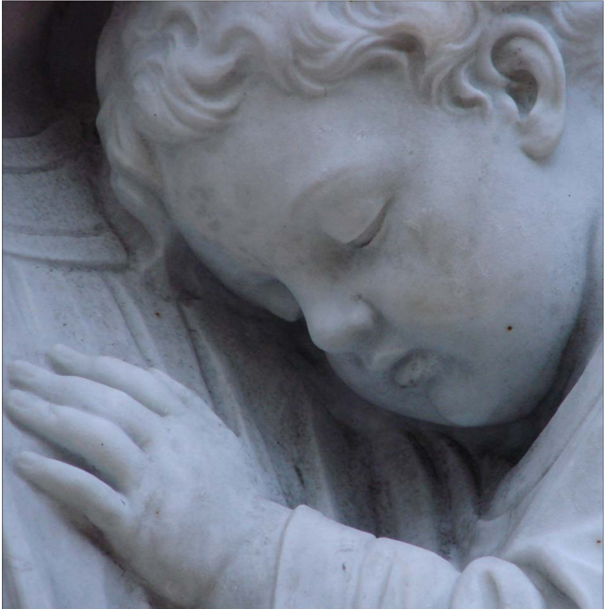
Today at the Noon Mass we celebrate the Santo Niño—the Holy Child Jesus. Sedes Sapientiae (detail), Archbishop Murphy Courtyard, St. James Cathedral.