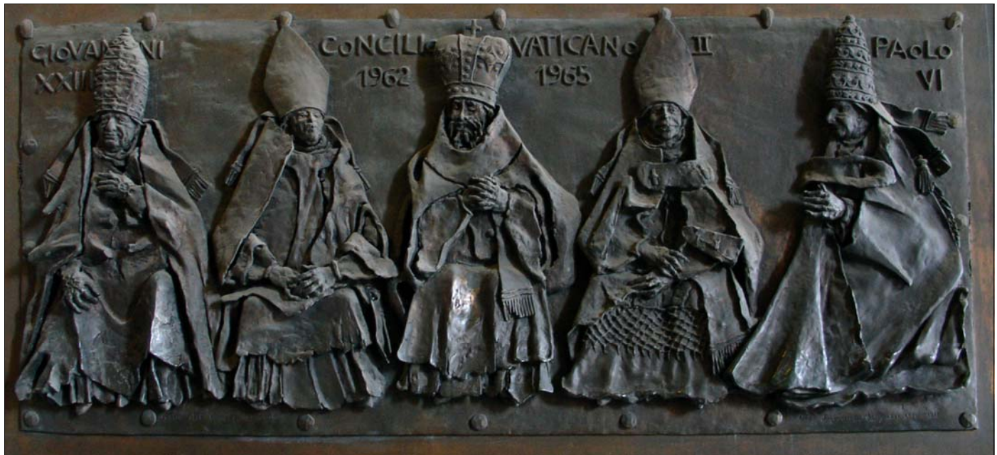
A relief on the doors of St. Peter's Basilica commemorates the Council. John XXIII is depicted at the far left.