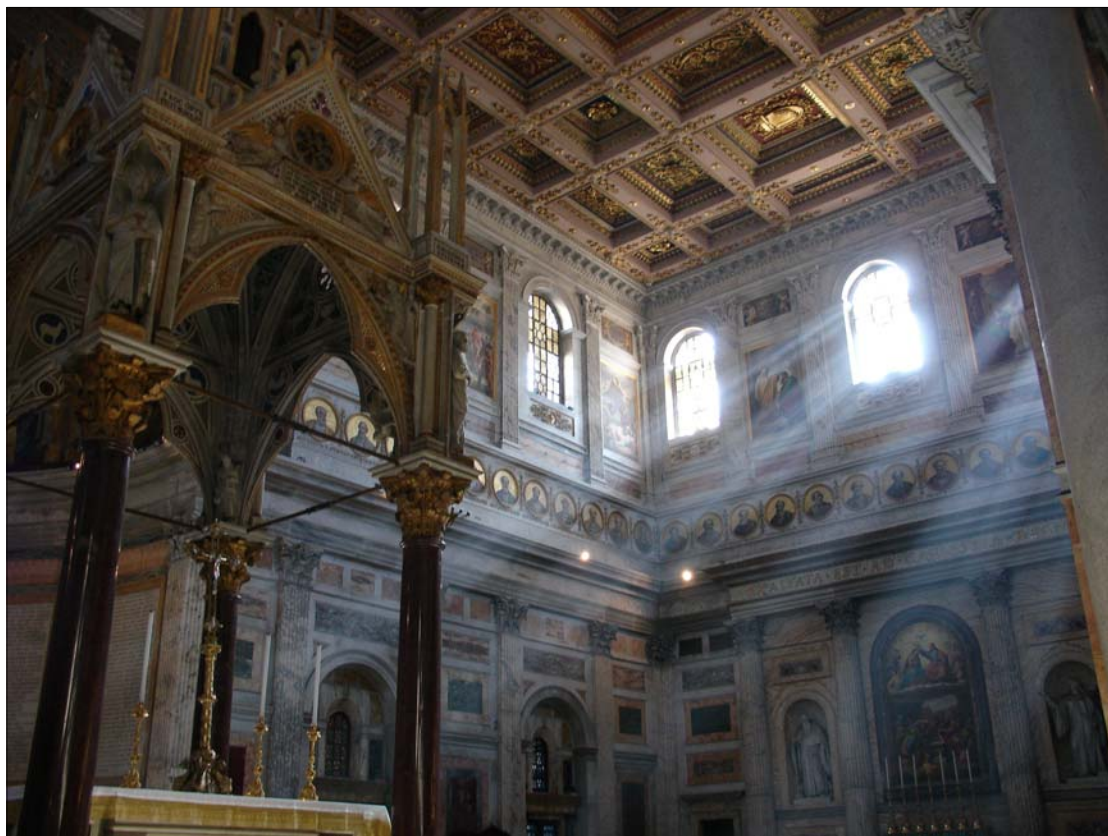
Interior of the Basilica of St. Paul Outside the Walls, Rome. It was here, on January 25, 1959, that Pope John XXIII announced his plan for the Second Vatican Council.

T hat first Christmas in the Vatican, Pope John XXIII revived an old custom of Pius IX, and astonished the world, by leaving the confines of Vatican City to visit orphans and prisoners in Rome. The children greeted him warmly, some of them mistaking him for "Babbo Natale," Father Christmas! The men at Regina Coeli prison knelt outside their cells to receive his blessing. A man convicted of murder wept as he asked the Holy Father