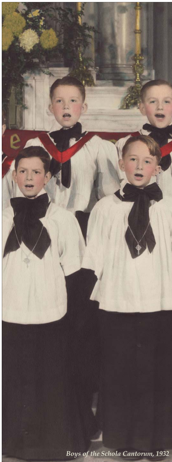
Boys of the Schola Cantorum, 1932

Phone 206.622.3559 Fax 206.622.5303 www.stjames-cathedral.org