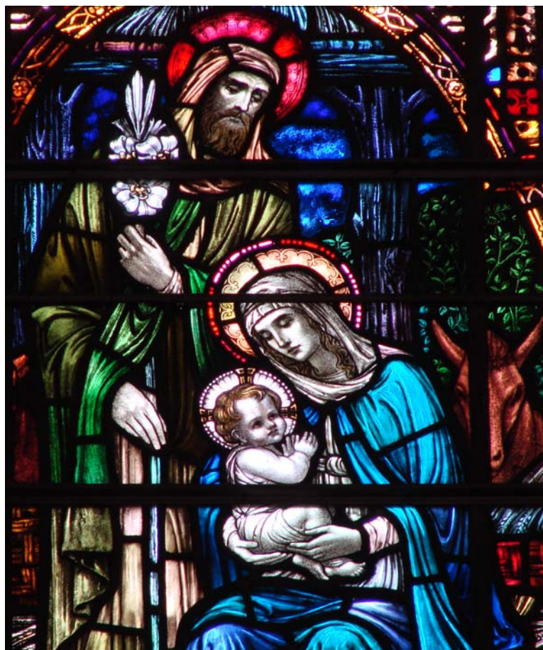
How can we make sure we take time this Christmas to stop and wonder at the God who came among us as a little child, born in a stable and laid in a manger?

CARING FOR OURSELVES COMES FIRST. When we fly on an airplane, we’re told that in the event of an emergency, we have to put on our own oxygen mask before we help someone else with theirs. In other words, we have to give ourselves some space to breathe before we can be effective in caring for others. It is the same when it comes to preparing for the holidays. We have to care for ourselves first. But that can be hard to remember when we’re so busy taking care of everyone we care about! So, during Advent, I try to be more careful to set aside time for prayer, to get enough sleep, to simplify my preparations so as to enjoy them more. Taking time for prayer is especially important in the midst of holiday frenzy, but I try not to turn this increased attention to prayer into another pre-Christmas task, itself another