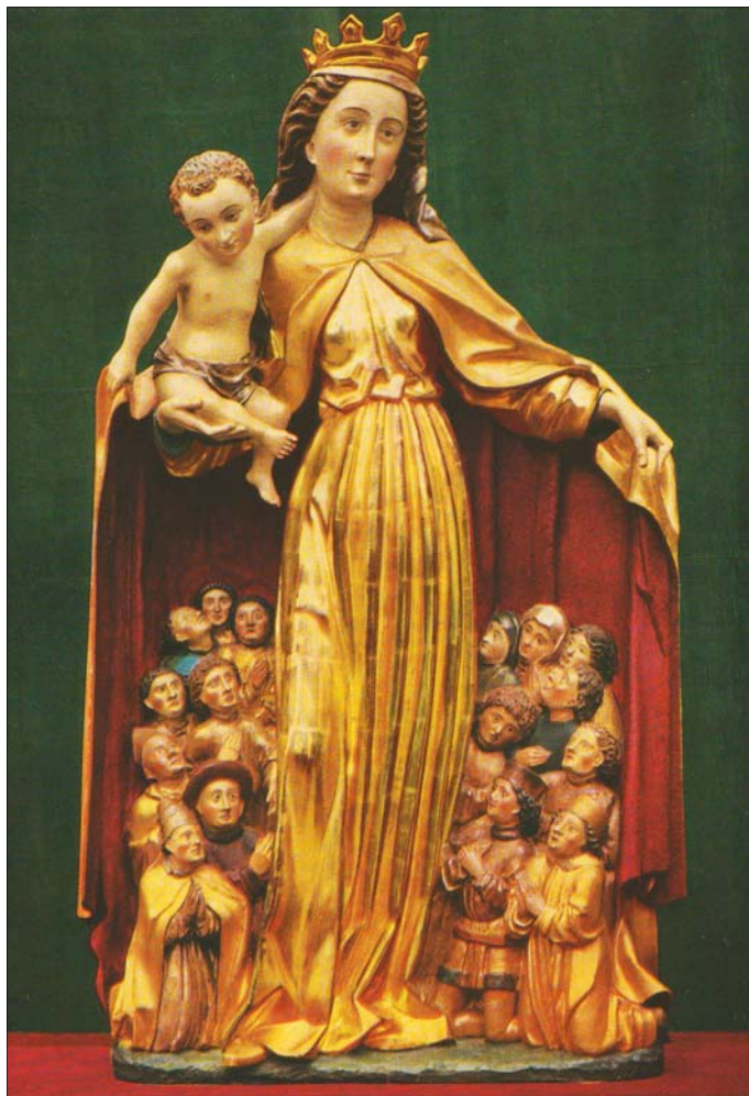
Schutzmantelmadonna, Markdorf, 1470

The great St. Bernard of Clairvaux once wrote, De Maria, numquam satis (One can never say enough about Mary). He was right. Maybe after reading the thoughts of your fellow parishioners you will find yourself thinking your own thoughts about Mary and who she is to you. During these days of Advent and Christmas when Mary is such a central part of the