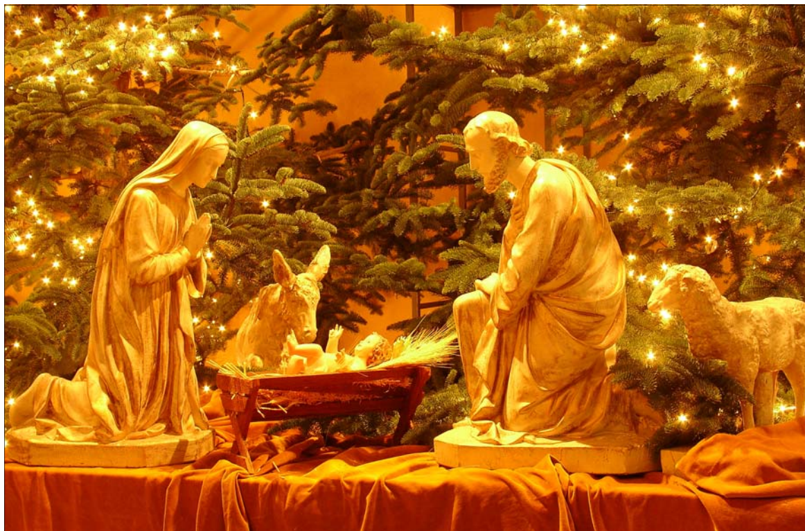
image comes to mind as I remember a time when I attended 5:30pm Mass on Christmas Eve.

C hristmas is my favorite holiday of the year. There is nothing more special to me than being able to celebrate the birth of Jesus Christ here at St. James Cathedral every December. As I write this reflection, one particular