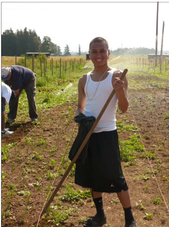
Experiencing what life is like for migrant workers in Washington State.