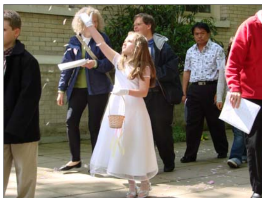
Top, May Crowning with fourth-graders on May 16. Below, First Communicants scatter flower petals in the great Corpus Christi Procession on May 25.