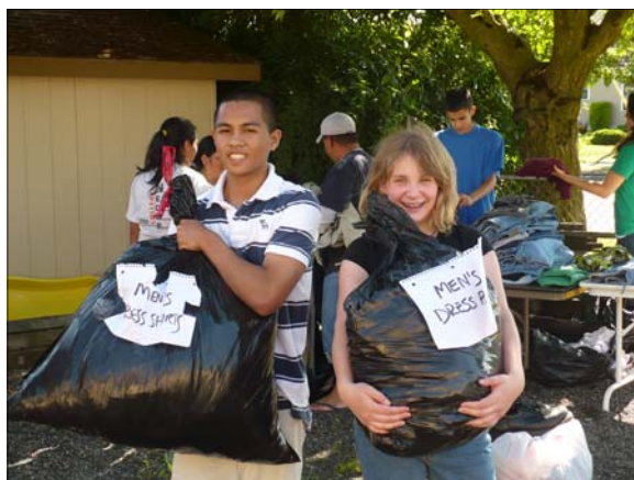
Above, the participants in the Youth Migrant Project got a special blessing at Mass on Sunday, July 6. Below, sorting a mountain of clothing donations!