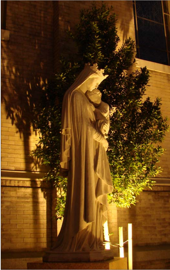
Image of the Divine

At the center of the Archbishop Murphy Courtyard on the south side of the Cathedral is the statue of Sedes Sapientiae – Mary, Seat of Wisdom. Mary has many titles – she is called “seat” or “throne” of wisdom because she holds Jesus, the Word made flesh, in her arms. For many years, this beloved image of Mary and her Son stood on the grounds of the Archdiocesan Seminary, St. Edward’s in Kenmore. Every May, the seminarians would gather in front of this statue at the end of the day to sing a hymn in honor of the Blessed Virgin Mary. To the intercession of Mary, cradling God’s own divine Wisdom, the seminarians entrusted all the hopes and struggles of their day.