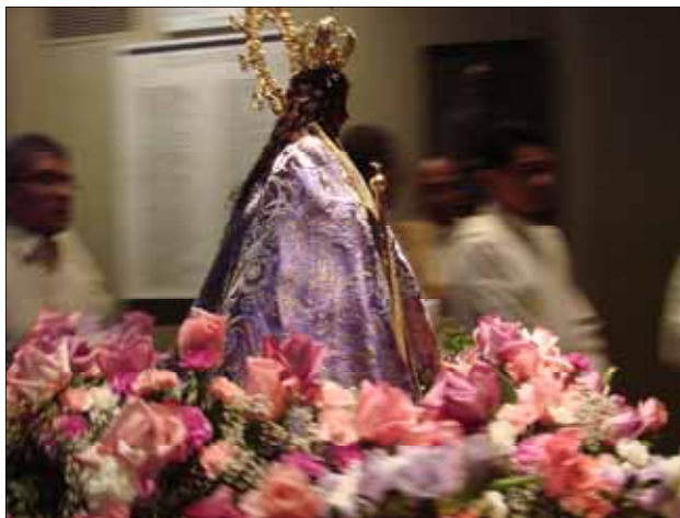
Above, Madre de las Americas; below, an image of Our Lady of Antipolo is carried in procession at Simbang Gabi.

Cathedral; for a church building, be it a great cathedral or a humble chapel, fulfills its highest calling not by being the church but by becoming a house for the church, a house for the People of God. And we are that people."