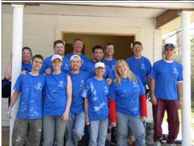
Above, members of our own St. James ESL staff had an opportunity to meet Governor Gregoire on February 20; below, a group of Cathedral parishioners spent a week in Biloxi in March, helping rebuild in the wake of Hurricane Katrina.