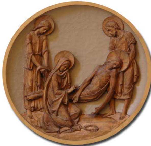
The way of the cross ends, not on Calvary, but at the gloriously empty tomb of Easter

F or many kids my age, Lent is just the month where we have to give up chocolate and can't eat hamburgers on Fridays. Personally, it did not seem to affect my life very much, except at church, where everything seemed somber and mysterious. I understood the rules of Lent, but I did not understand Lent itself, and I certainly could not