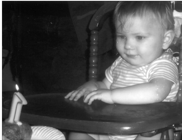
Our very first client celebrates his first birthday!