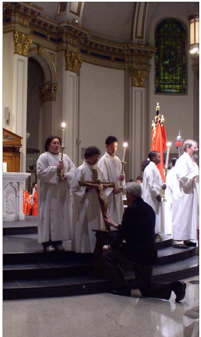
Veneration of the Cross on Good Friday

On Good Friday during the singing of "Were You There When They Crucified My Lord?" I look around at the family of man standing at the foot of the cross.