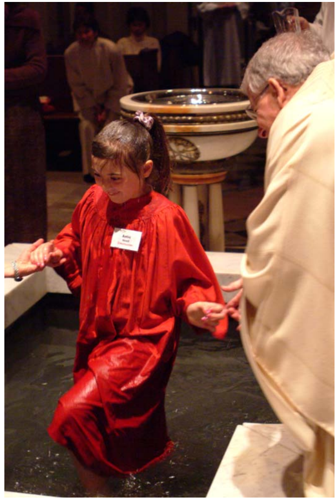
Our Lenten journey concludes with the joy of Easter. At the great Easter Vigil on April 15, fifteen adults and children will be baptized.

One of the primary reasons I am so drawn to the austere beauty of Lent is that, with its traditions of simplification, purification, and sacrifice, it is directly conducive to this kind of prayer. While most prayer is associated with some sort of utterance—be it petition, thanksgiving, an expression of penance, whatever—the kind of prayer experience I'm talking about is, if anything, characterized by wordlessness, is coaxed forth by silencing my mind and will, by dismantling the verbal bulwarks which sometimes separate me from God. It is also characterized by a sort of freshness, a sense