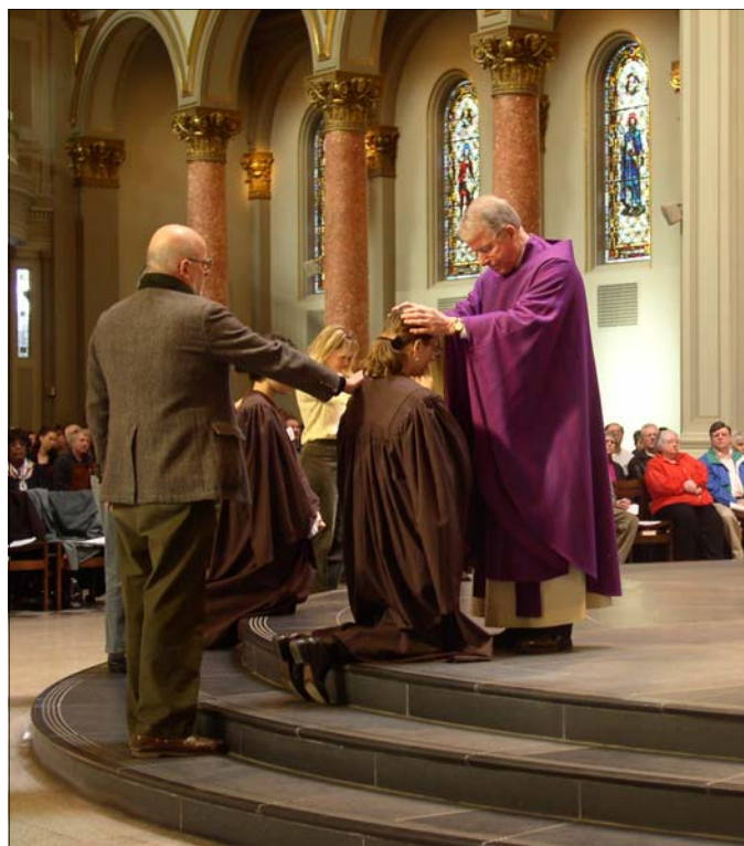
The Scrutiny of the Elect calls down special blessings on those preparing for the Sacraments of Initiation at the Easter Vigil

Jesus seems to imply that we need to love ourselves. That may seem like a call to arrogance and selfishness, but I don't think it is. I suspect that most people don't really love themselves as much as they might, and instead of learning to love themselves they fill their