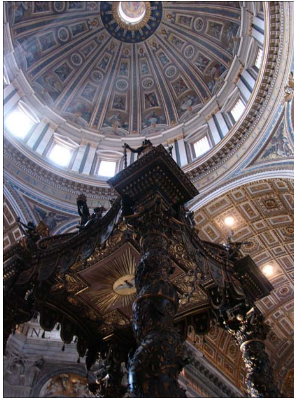
The baldacchino and dome of St. Peter’s Basilica, Vatican