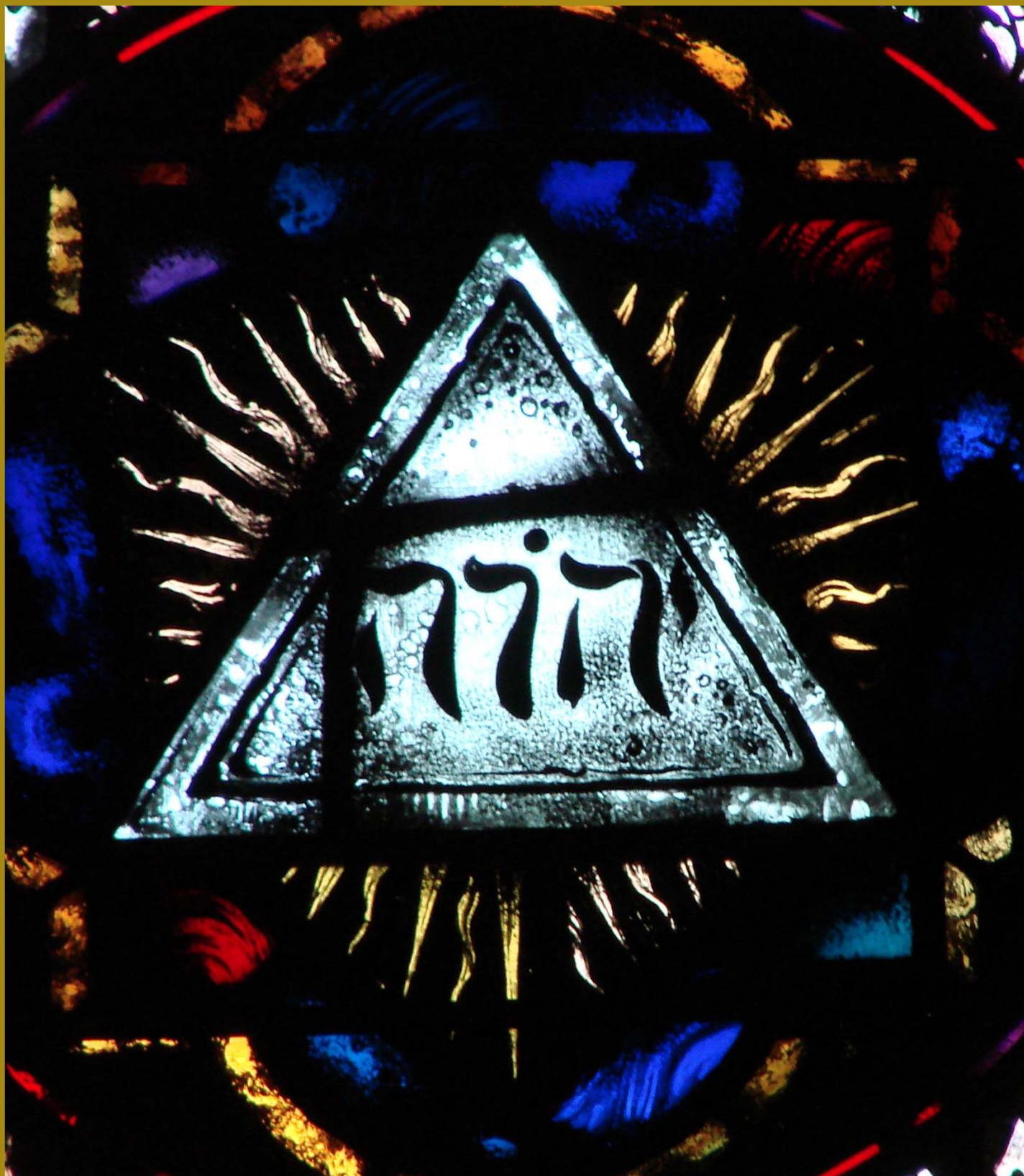
ST. JAMES CATHEDRAL The Most Holy Trinity May 22, 2016