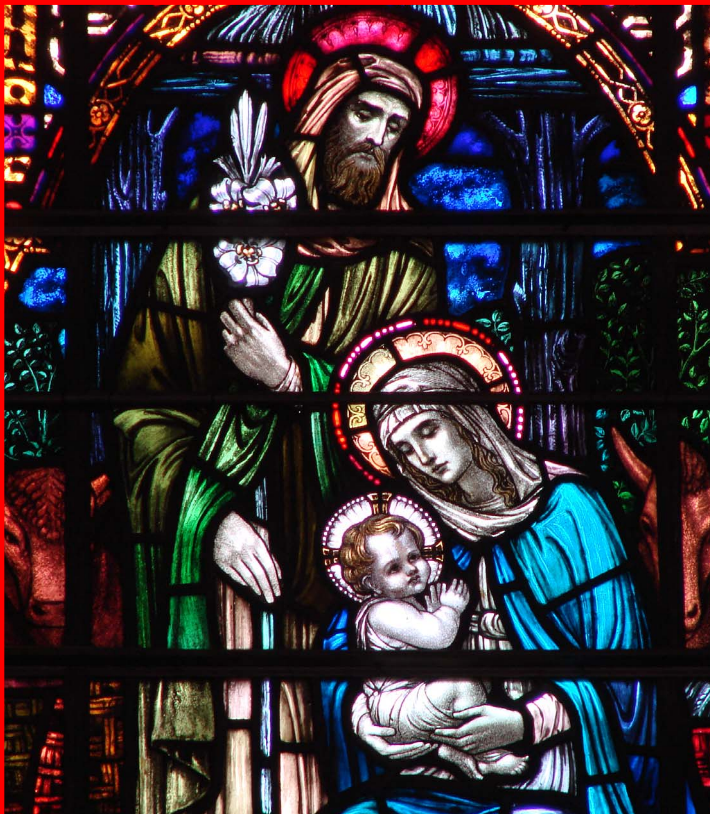
ST. JAMES CATHEDRAL The Holy Family of Jesus, Mary, & Joseph December 27, 2015