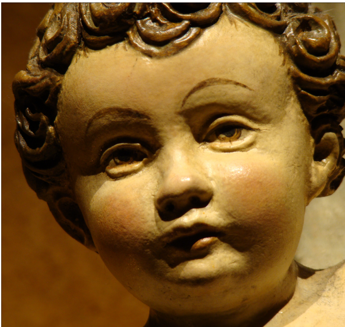
Rise, take the child and his mother, flee to Egypt Detail of the Child Jesus, Shrine of the Blessed Virgin Mary, St. James Cathedral