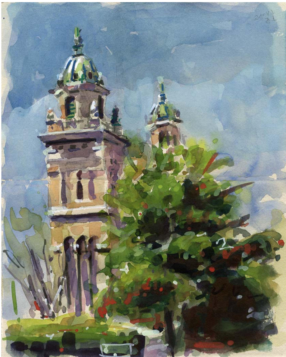
Cathedral towers seen from the Frye Art Museum Watercolor painting by Bill Sharp