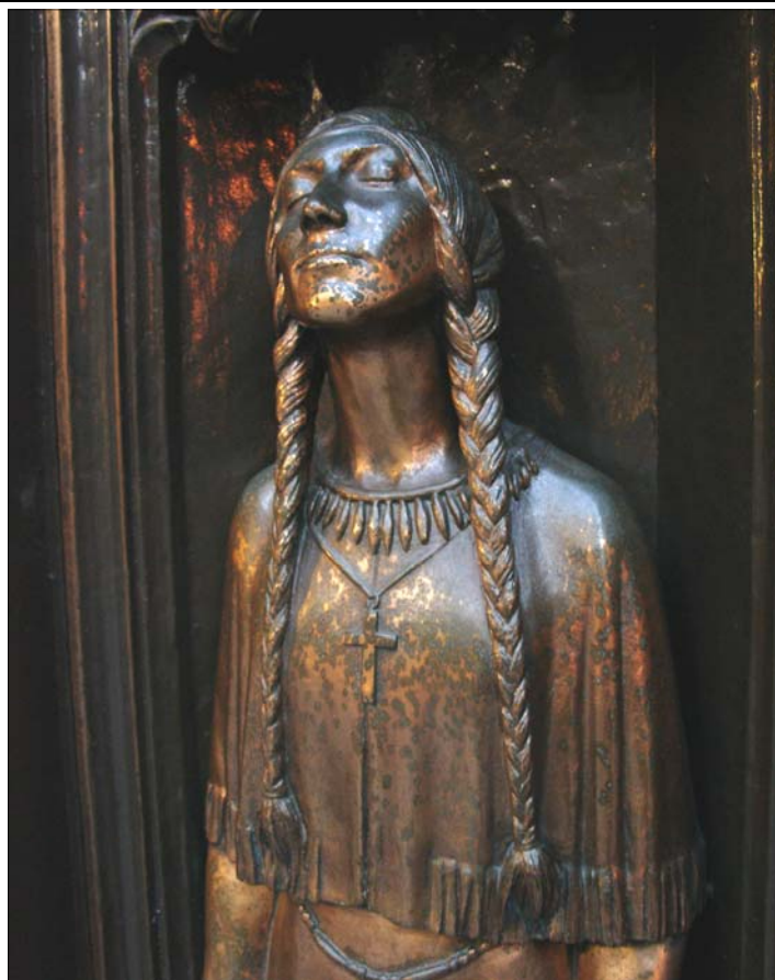
Image of Blessed Kateri Tekakwitha on the doors of St. Patrick Cathedral, New York City

Kateri endured much mockery and maltreatment for her faith. When she heard of the Mission of St. Francis Xavier du Sault, where she could practice her faith in peace, she left her home and set out on foot. There she spent the rest of her life, living among other Christian converts. She longed to enter religious life, but was not permitted to do so,