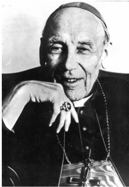
In 1960, Pope John XXIII appointed Cardinal Augustin Bea as the first leader of the Secretariat for Promoting Christian Unity, a newly-established office in the Roman Curia. Cardinal Bea had a profound impact on the Council's teachings in the areas of ecumenism and inter-faith relations.

While the Council did produce one document, Unitatis Redintegratio , which dealt specifically with relations with non-Catholic Christians, ecumenical themes emerged again and again in the various constitutions, declarations, and decrees. For example, Dei Verbum , the Constitution on Divine Revelation, encourages the joint preparation of Biblical texts and translations "by a common effort shared by our separated brethren... the resulting works can be used by all Christians" (22). And Lumen Gentium , the Constitution on the Church, paved the way for