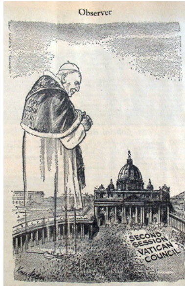
The spirit of Pope John XXIII watches over the second session of the Council. Progress , 1963.

During the Vacancy of the Holy See, all the work of the Council was of course suspended. But those who hoped that the Council might not be reconvened that year, or ever, were destined to be disappointed. Paul VI made it clear from his very first days as Pope that the Council would reconvene as planned, in September of 1963. Then, just a week before the Second Session opened, Paul VI announced that he would reform the