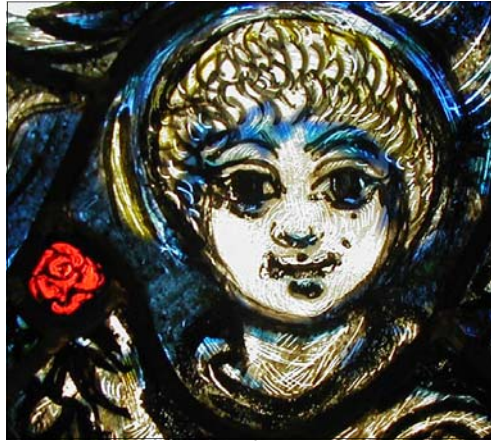
Every child brings us God's smile Pope Benedict XVI

Joseph Cardinal Bernardin, A Consistent Ethic of Life