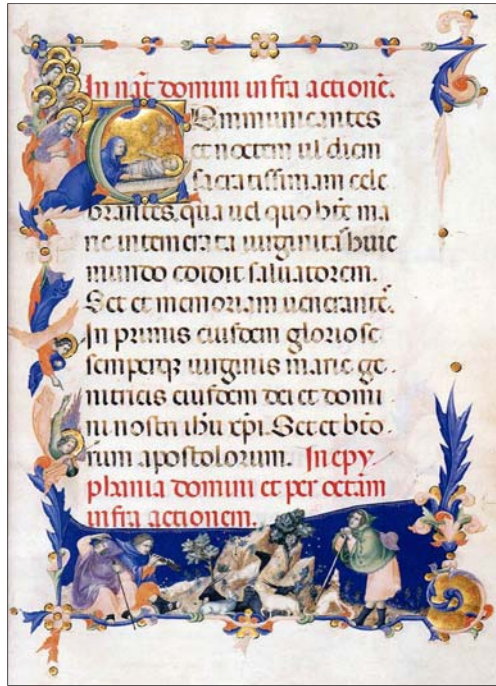
A page from a Roman Missal, dating from 1320. The text is that of the Roman Canon (Eucharistic Prayer I) for Christmas: "...that most sacred night on which blessed Mary... brought forth the Savior for this world..."

Because the principles of translation are so different, the resulting translation brings significant changes to the language of the Mass. The most noticeable changes will be in the people's responses, including the Greeting (when the priest says, "The Lord be with you," we will respond "And with your spirit"). Because some of the