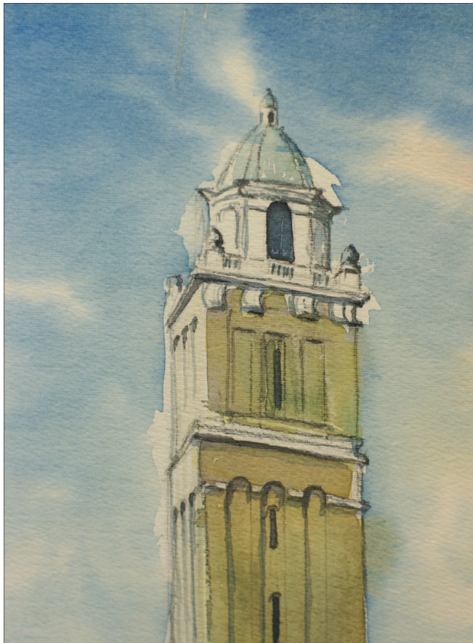
Watercolor painting by parishioner Patrick White