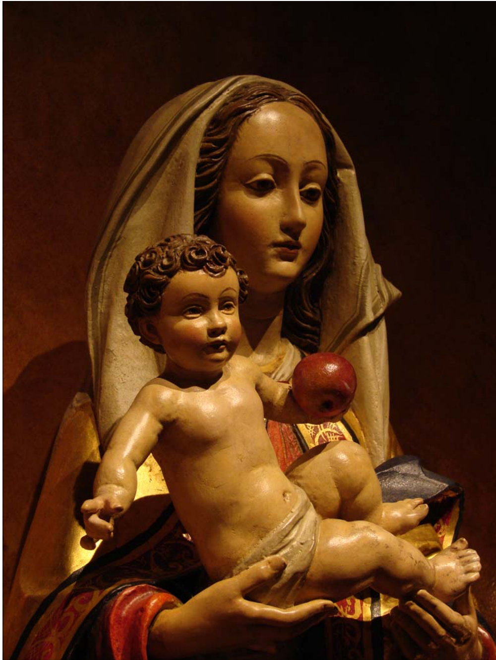
The Shrine of the Blessed Virgin Mary, St. James Cathedral