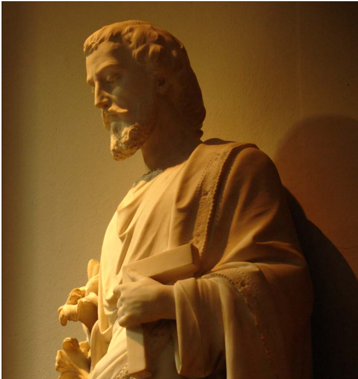
Joseph, son of David, do not be afraid Statue of St. Joseph, St. James Cathedral south aisle. Artist unknown, 1907.

ST. JAMES CATHEDRAL The Fourth Sunday of Advent December 19, 2010