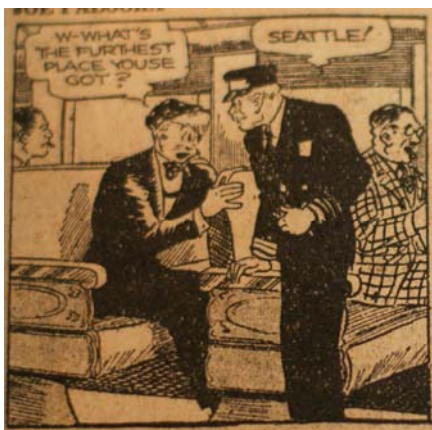
Above: a formal portrait captures the keen gaze of Gerald Shaughnessy, the fourth bishop of Seattle.