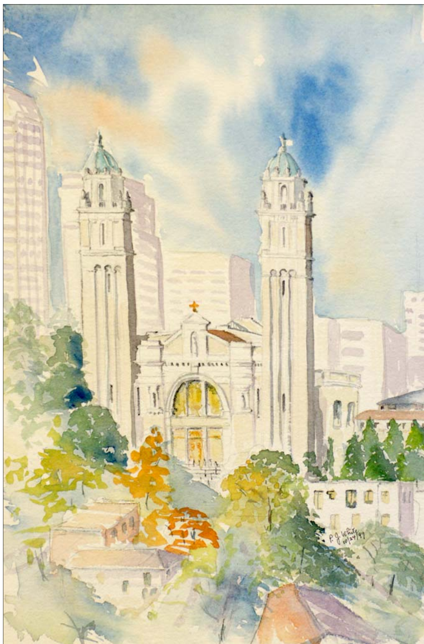
Watercolor by Cathedral Parishioner Patrick White