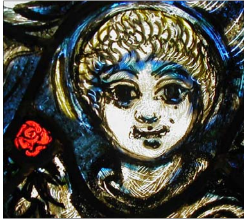
Every child brings us God's smile Pope Benedict XVI

What happens when a child feels unloved, unwanted? There is nothing to compare with the terrible loneliness of a child; fragile and helpless, a lonely child feels fear, anguish, a sense of guilt. And