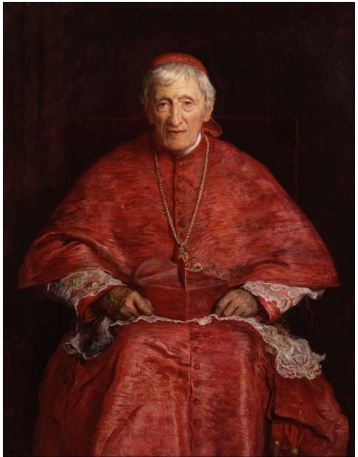
Portrait of Newman by Sir John Everett Millais

During the beatification ceremony today, the Holy Father will declare Newman Blessed. Then his portrait will be unveiled, relics of the saint will be brought forward in procession by members of the Newman family, and the entire assembly will give thanks in Newman’s own words: