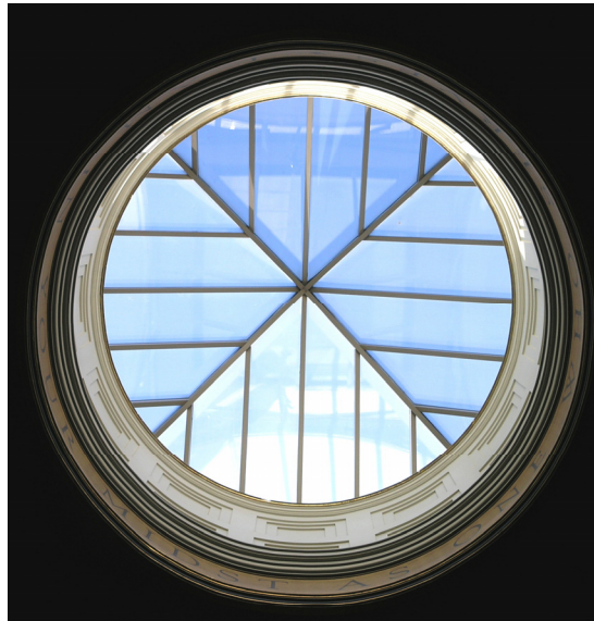
The inscription in the oculus over the altar is taken from Luke's account of the Last Supper. It is a constant reminder to us that the mystery we celebrate around the altar must be carried out of the Cathedral and into the world.

Help us bring your love to the world Give us new purpose Lead us to share his life forever Touch our lives and lead us to you Teach us the way to eternal life Continue its saving work among us Keep us single-minded in your service