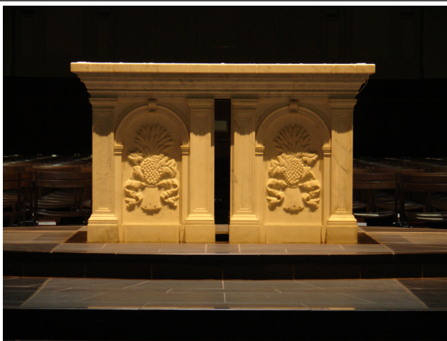
"Rest in peace, holy altar of the Lord.... May the Lord grant me to see you in the assembly of the firstborn which is in heaven."

In the General Instruction of the Roman Missal , the term "recessional" is never used. Recessional implies that we simply go back where we started. And that's exactly what we don't want to do after our celebration of the Eucharist! We have prayed that the celebration will transform us, and not only us, but the world we live in. And so it's good that we always process: we always go forward. Led by the cross, the ministers go out of the church, and then, the entire assembly joins that procession. We stream out to live the word we have heard, and the sacrament we have received, in a thousand different places and a thousand different ways.