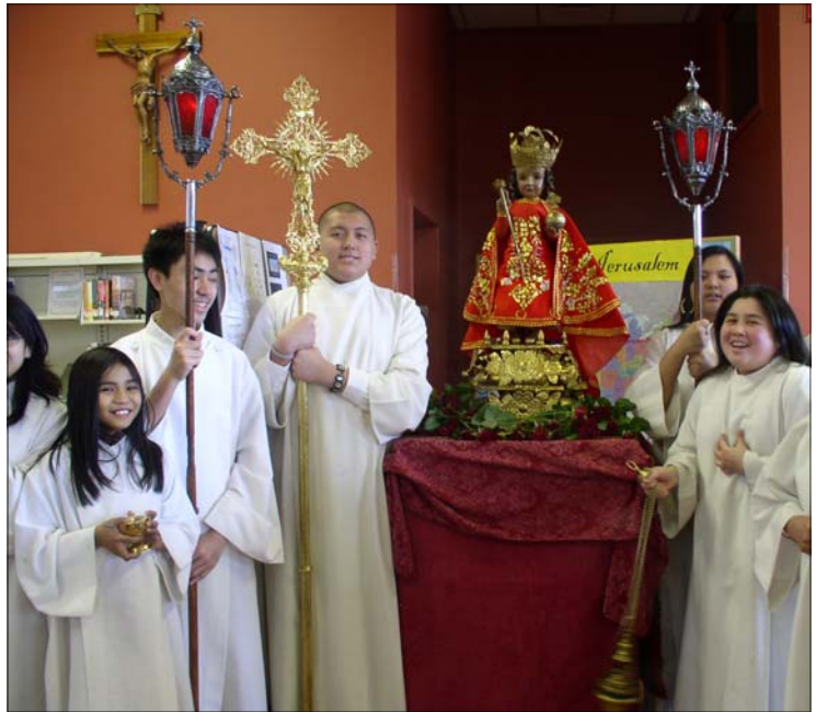
Cathedral servers gather with the image of the Santo Niño— Holy Child at the celebration in 2008.

More than 40 years later, the Spaniard Legazpi led a new expedition to the Philippines. They found the town of Cebu nearly destroyed by fire. But amid the ruins, they discovered a wooden box. Inside it lay Queen Juana's statue of the Child Jesus, miraculously intact. Spaniards and natives alike took this as a sign. They built the first Catholic Church in the Philippines on the spot where the image was discovered, and dedicated it to the Santo Niño, the Holy Child. From that time on, the finding of the image has been celebrated in the Philippines with a great annual festival in the month of January, including a solemn liturgy, and dancing and feasting as well.