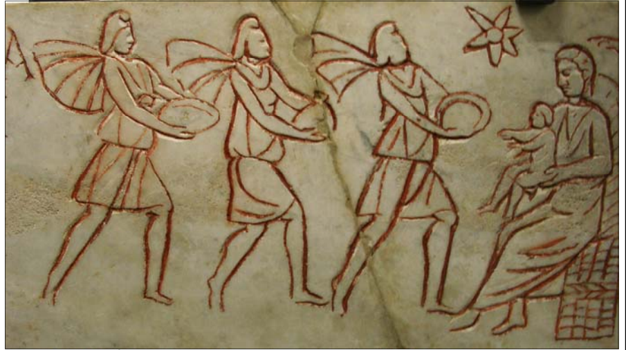
An ancient depiction of the visit of the wise men to the infant Christ from the Vatican Museums

Leader: Let us pray, Christus mansionem benedicat , May Christ bless this house!" Amen!