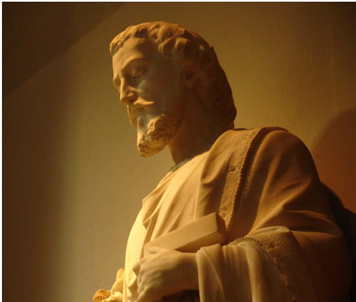
Joseph, son of David, do not be afraid Statue of St. Joseph, St. James Cathedral south aisle. Artist unknown, 1907.