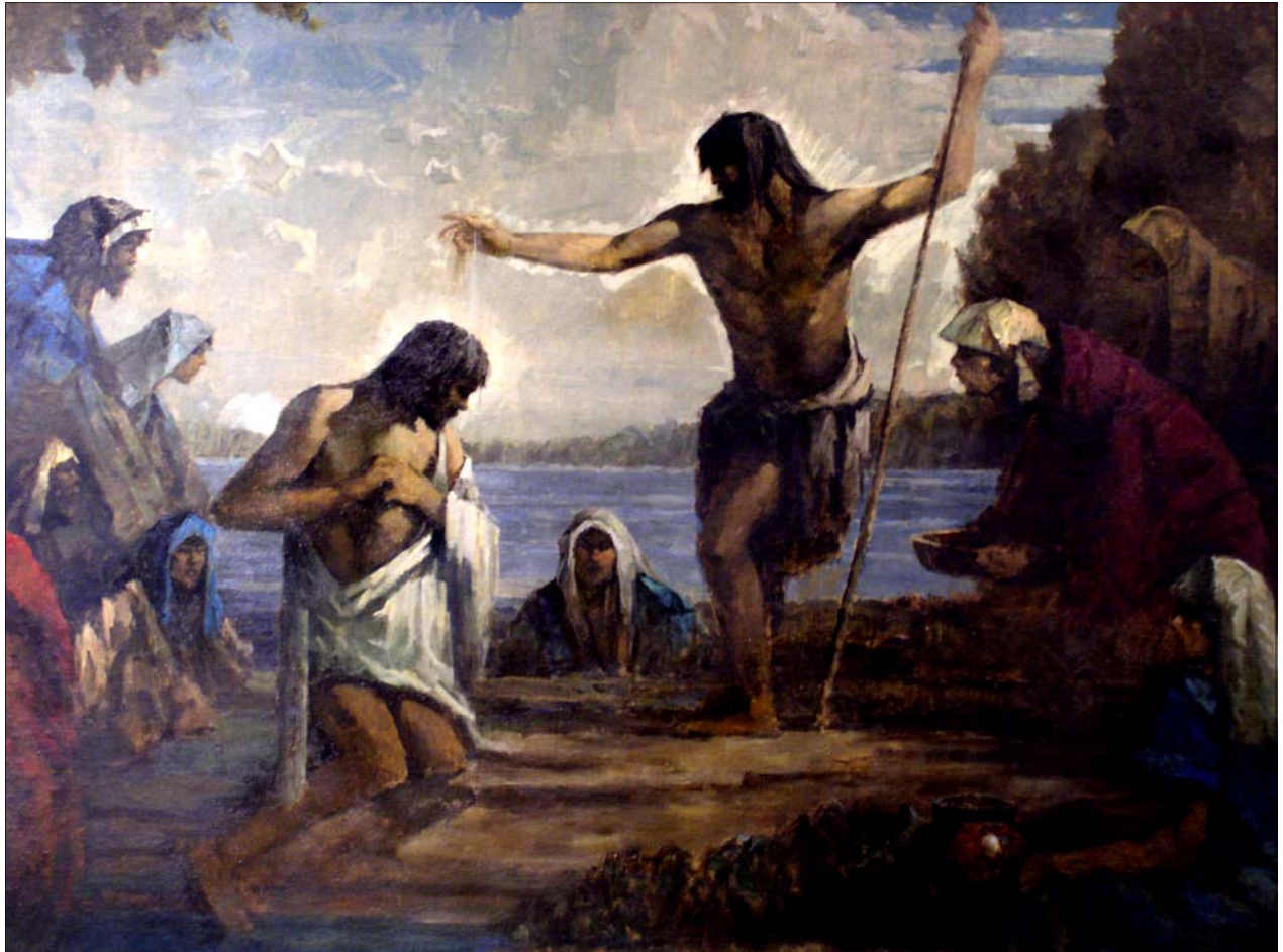
John went throughout the whole region of the Jordan, proclaiming a baptism of repentance The Baptism of the Lord, Eustace Ziegler, 1950. St. James Cathedral Reconciliation Chapel