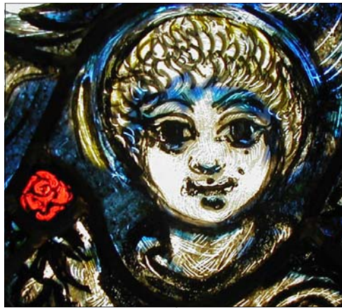
Every child brings us God's smile Pope Benedict XVI

What happens when a child feels unloved, unwanted? There is nothing to compare with the terrible loneliness of a child; fragile and helpless, a lonely child feels fear, anguish, a sense of guilt. And