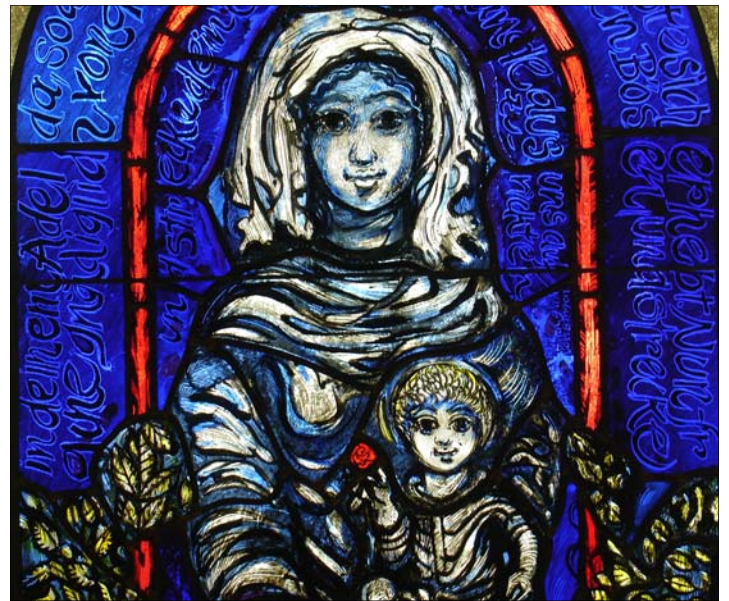
MARY, MOTHER OF THE LIVING, PRAY FOR US!

Joseph Cardinal Bernardin, A Consistent Ethic of Life: An American Catholic Dialogue , 1983